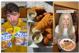
2023 Ad Age Small Agency Awards Best Use of TikTok winner

The campaign, video or action will have leaned into one or more of TikTok’s core pillars: